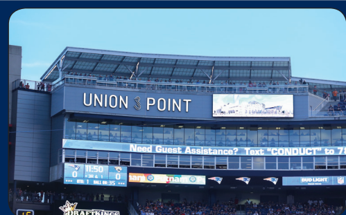
Union Point offers fans new amenities on Gillette Stadium's upper concourse.