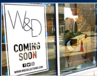
Whiting & Davis is opening its first storefront location at Patriot Place.

Whiting & Davis, a high-end fashion and fine collections retailer, opens its flagship store at Patriot Place in October. The store will feature the company's jewelry collections, mesh handbags, wallets and many accessories. The Patriot Place store, located between Dunkin' Donuts and Godiva, showcases fashionable products, including Whiting & Davis' iconic meshes, elegant pearls, clean metals, fun colors and vintage styles that cater to women of all ages.