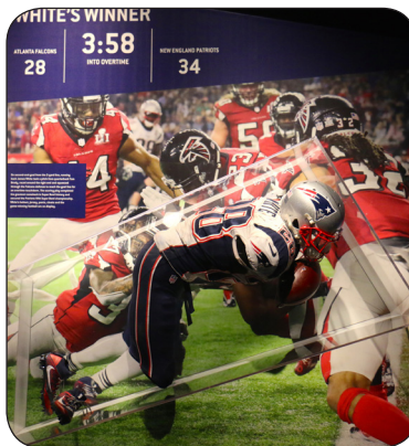
The uniform James White wore, along with the football he carried, during the game-winning touchdown in overtime of Super Bowl LI is on display at The Hall.

The result is a stunning new area within the Super Bowl Experience exhibit that uniquely tells the story of the Patriots' historic comeback to claim their fifth world championship. The addition is called the "Anatomy of a Comeback" and features eight monitors in a mosaic-like display to show exclusive interviews with Patriots head coach Bill Belichick, wide receiver Julian Edelman, running back James White, defensive back Devin McCourty and defensive lineman Trey Flowers. The interviews and video presentation gives fans firsthand accounts of how the Patriots' dramatic overtime victory in Super Bowl LI unfolded.