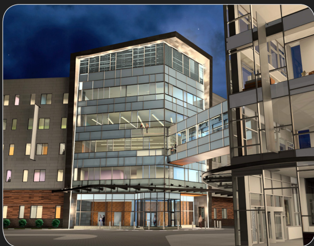
A rendering of the medical office expansion project at Patriot Place.