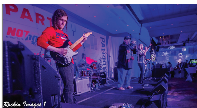
Foxborough-based band Thirty 6 Red performed for the Patriots at multiple Super Bowl LII events, including the team's official pregame tailgate party on Super Bowl Sunday.

Politano said the band enjoyed their time together on the tour bus playing games, watching movies and jamming out during their journey