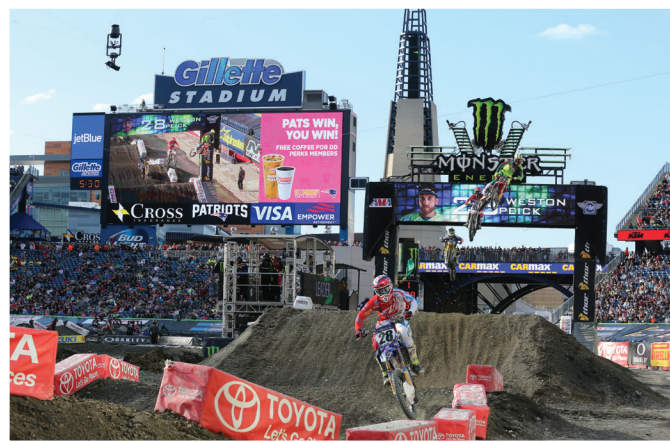
Gillette Stadium's 2018 special events season kicks off on April 21 with Monster Energy AMA Supercross.

The Memorial Day Weekend NCAA Men's Lacrosse tournament, featuring the best of