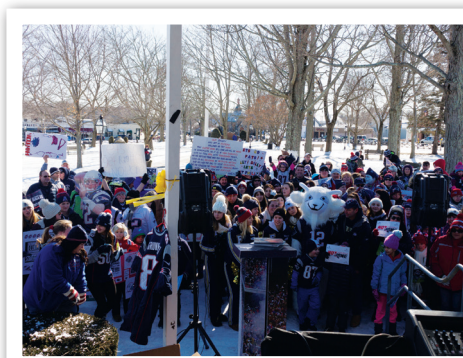
Residents gather on the Common for the Super Bowl LII Hometown Rally on Feb. 3.

We are well underway in our work and preparations for the 2018 season and we hope it will be another exciting year in Foxborough as we are NOT DONE in our pursuit of a sixth Lombardi Trophy.