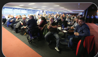
Patriots Season Ticket Members who reside in Foxborough attend the organization's first ever Foxborough Season Ticket Member Forum at Gillette Stadium.

That's why the Kraft Sports and Entertainment team launched a quarterly forum dedicated specifically to Patriots Season Ticket Members residing in Foxborough. The goal of these forums is to communicate more regularly with the team's neighbors and