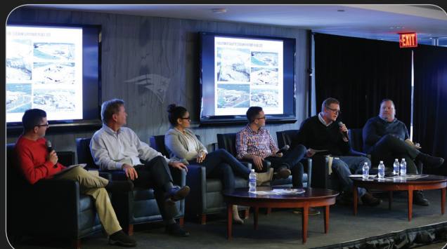
Members of the Kraft Sports & Entertainment Group introduce a new quarterly forum to Foxborough residents who are also Patriots Season Ticket Members at Gillette Stadium on Jan. 11.