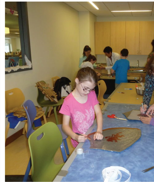
Approximately 250 Foxborough children enjoyed a number of activities at the Foxborough Kids Reads program based on the novel, "The