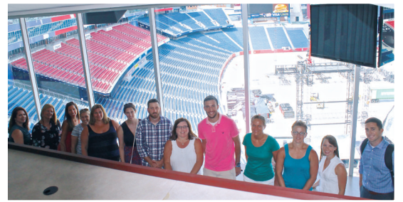
Foxborough's new teachers visited the press box inside Gillette Stadium as part of a stadium tour conducted by members of the Kraft organization as a way to welcome the group to the community.