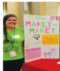
Ahern Middle School students participating in STEM activities at the Envision the Future STEM program at Bridgewater State College.

The weeklong camp gave 42 middle school girls from 17 communities in southeastern Massachusetts an opportunity to participate