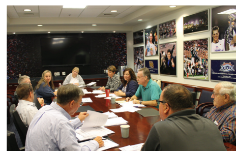
The PIP Fund's Grants Committee meets monthly at Gillette Stadium to review grant applications and allocate funds.